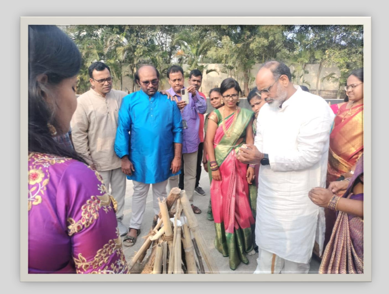
Bogi Celebrations Started by lighting the bonfire by principal sir

The central event of the celebration was the symbolic Bogi fire , where students and faculty gathered to light a bonfire, symbolizing the burning of old and welcoming the new. The college's Bogi celebration aims to foster a sense of tradition, unity, and creativity among students and staff.